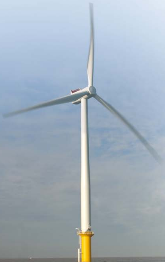
Artist's impression of Siemens 6MW Wind Turbine

Our team at Morrisons supermarket, located on the Waterglade Retail Park, close to the site of the onshore substation, spoke to hundreds of you over the three days. They gave out many leaflets and encouraged everyone to pop along to the main event to find out more. Thank you to all of you who took the time to talk with us at either of our event locations; we hope you found it useful.