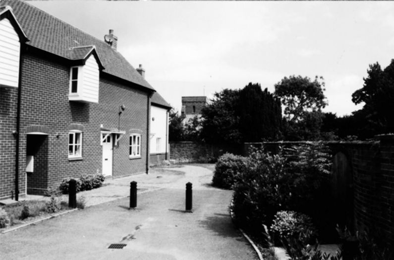
4. This recent development by the Rural Housing Trust has an attractive relationship with the crinkle-crankle wall associated with Bradfield Place. The mature planting of the former vicarage and the churchyard are also important features in this view.