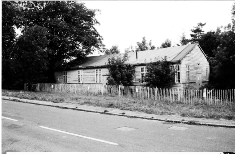
6. The substantial timber hall opposite the Church of St. Lawrence is a significant feature on Harwich Road. Its mature planted setting softens its appearance, its poor repair detracts from the character and appearance of the Area.