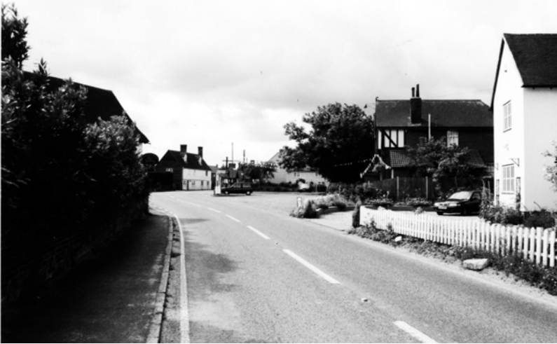
2. The centre of the Area from Station Road. Squire's Cottage and Barley Cottage beyond the Strangers Home are important from this viewpoint in defining the Area's character. The pub and Beer House Cottage assist in the street scene though not to the same extent as the older cottages.