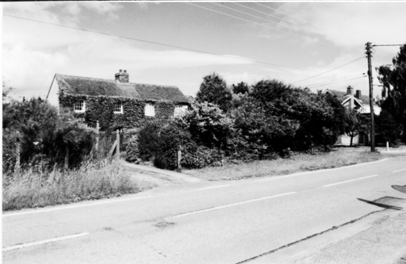
8. Frontage planting and the setting back of these cottages make them neutral as far as the character of the Area is concerned. The houses on the north side of Mill Lane are unsympathetic in design terms, and the open aspect of the group gives it an appearance at variance with the good character of the Area.