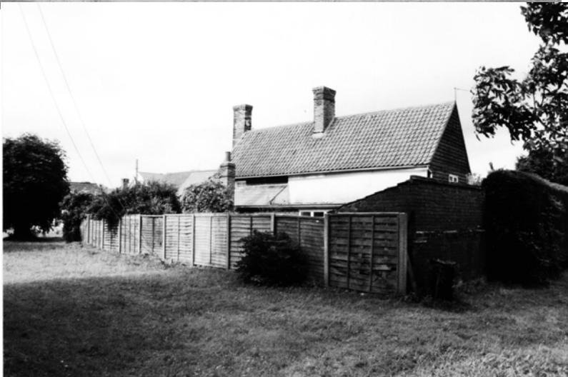
7. Squire's Cottage is effectively an island site within the churchyard. As such its rear boundary of timber paneling is visually unsatisfactory and might be replaced with something more permanent.