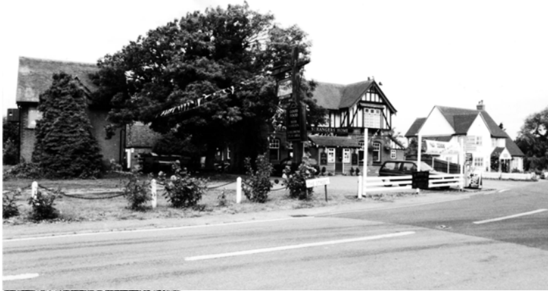
5. The outbuildings to the Strangers Home form an interesting group, along with the mature tree at the centre of this photograph. In other respects the grounds of the buildings are a disappointment, with poorly maintained surfaces and a wide range of frontage treatments.