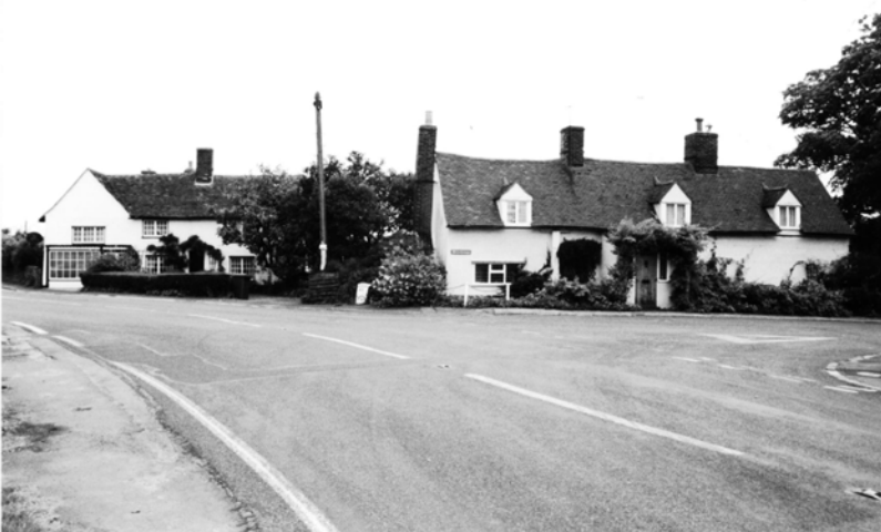
3. Acacia House and Milestones Cottage, with the listed 19 th century milestone between. These listed cottages define the northern edge of the road junction, though the area of tarmac is now rather overwhelming.