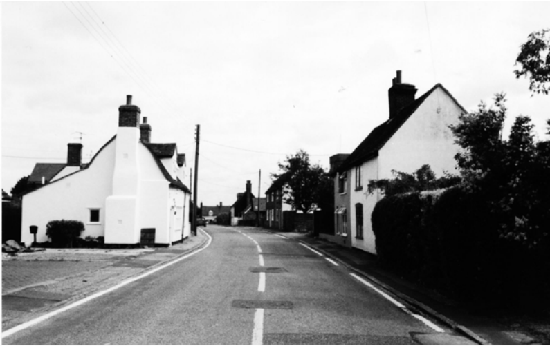
1. The Street looking northwards. This view encapsulates the essence of the Area, with individual or paired cottages positioned close to the carriageway with significant gaps between. Cottage gables and the treatment of side gardens is also of importance to the character of the Area