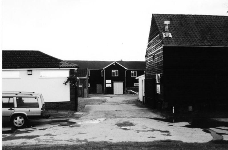
6. The entrance to the yard occupied by the buildings. Labelling. On the right and in the distance are the most significant structures on the site; their presence has historic significance and help to enclose the area. Investment in these buildings and their surroundings would be an enhancement of the Area as a whole.