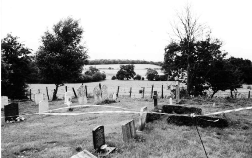
2. This view taken next to the west tower of the church is one of a sequence overlooking the Creek from this part of the churchyard. The extensive churchyard has many mature trees, and gains interest from the combination of formal and informal maintenance.