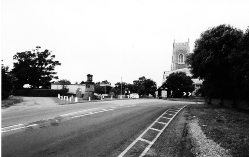
1. Church Road, All Saints Church and the road junction from the south east. The visual significance of the main road is clearly apparent in this view, as is the important mature planting to the frontage of the Hall on the right of the photograph.