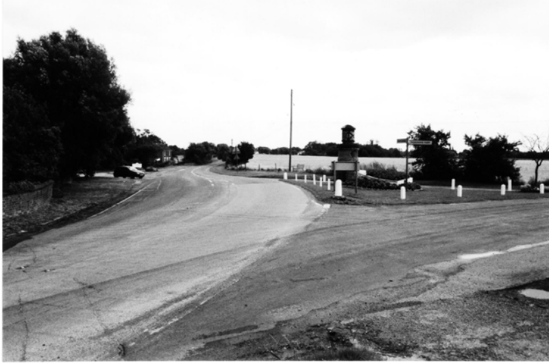
5. Church Road from the Lych gate, looking towards the town. Once again the road is dominant, reinforced by the relative amenity associated with the road junction.