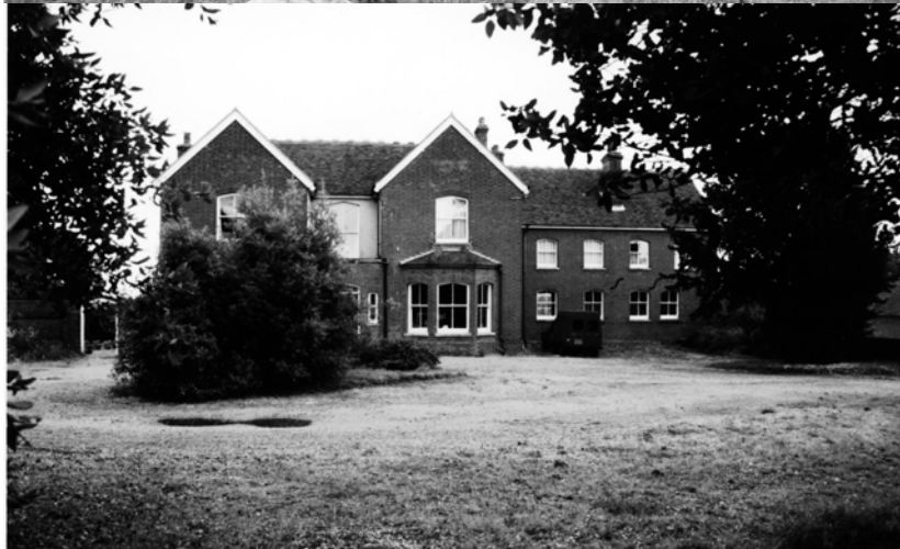
3. The front elevation to the Hall shows its simple detailing and the vestiges of its former designed setting.