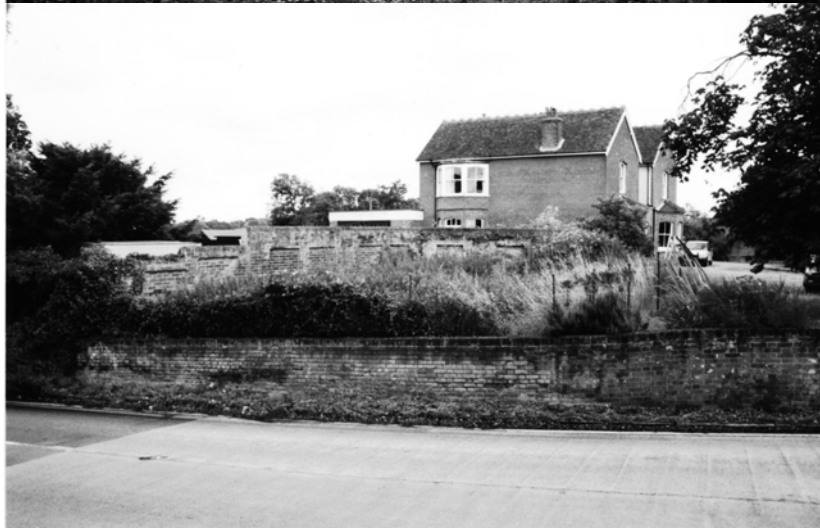
4. The Hall from the churchyard frontage to the west. The front boundary wall, incidental walling within its curtilage and the mature trees are all significant features which would be enhanced by greater maintenance.