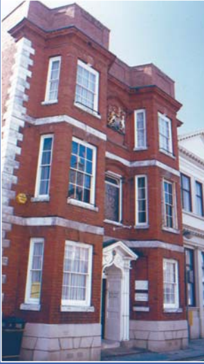
Guild Hall, Harwich