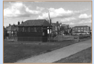
Treadwheel Crane, Harwich