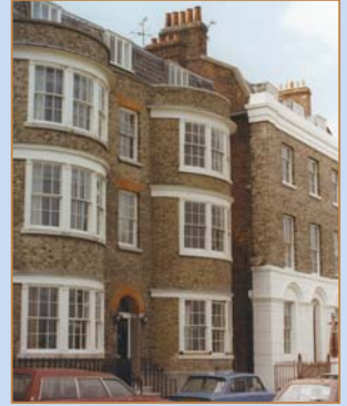
Grade II* listed building in Harwich

Applications for Listed Building Consent will be in addition to any Planning Permission you need. In most cases, however, the two applications are dealt with together. Before commencing any works to a Listed Building it is always advisable to check with the Council to find out which, if any, applications are required and whether they are likely to be dealt with favourably.