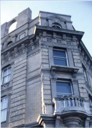
Former Great Eastern Hotel, Harwich

The responsibility for keeping a Listed Building in a reasonable state of repair rests in the first instance with the building’s owner. Each owner should consider themselves as a temporary steward or custodian of the building as well as just its present owner. Listed Building owners are strongly advised to carry out regular and timely maintenance on their property to avoid expensive repair bills in the longer term. Such advice is readily available from various sources including the following website: