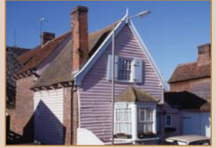
St. Osyth village

Listed Buildings are officially defined as “buildings of special architectural or historic interest”. As required by the Planning (Listed Buildings & Conservation Areas) Act 1990, such buildings are included on a list drawn up by English Heritage and the Department for Culture, Media and Sport. Within Tending District there are over 960 “list entries” comprising 23 at Grade I ( exceptional interest), 43 at Grade II* ( outstanding interest) and the remainder are Grade II (special interest). As each list entry can apply to more than one building it is estimated that there are over 1100 Listed Buildings in the District.