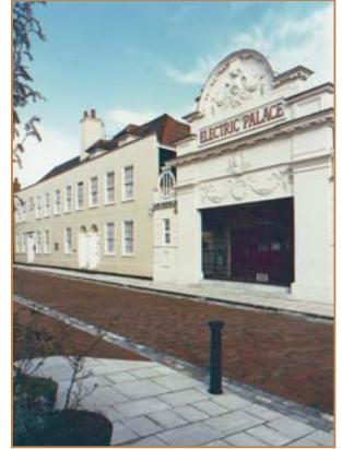
Electric Palace Cinema, Harwich and Kings Quay Street