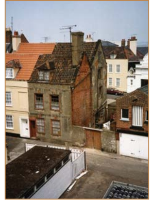
Listed Building prior to repair and renovation

Go to 'Heritage Protection' and then 'Principles of selection for designated buildings'.