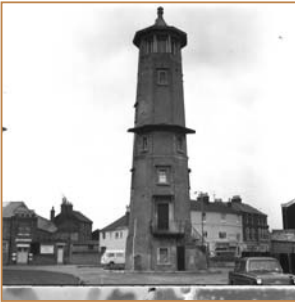
High Lighthouse, Harwich

www.english-heritage.org.uk or email applicationeast@english-heritage.org.uk