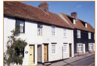
Listed cottages in St. Osyth