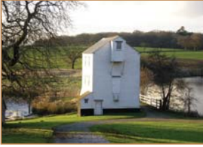
Tide Mill, Thorrington