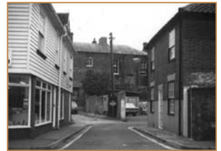
Listed Buildings in Harwich