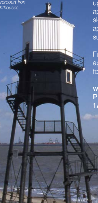
Dovercourt Iron Lighthouses