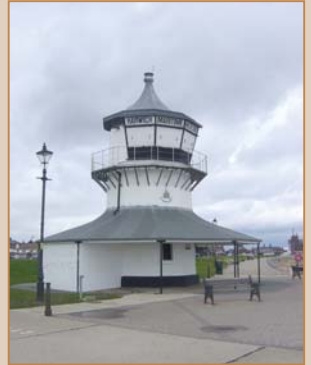
Low Lighthouse, Harwich

The fact that buildings are listed does not necessarily mean that they must be preserved intact and unaltered for all time, rather the aim is to ensure that decisions made today do not adversely affect the enjoyment of these buildings in years to come.