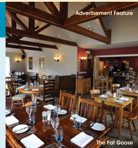
The Fat Goose

Monday to Saturday a special lunch is offered... Lunch with Chef - 2 courses for £10.00 or 3 courses for £12.00, no choice just superb food at a great price, chosen by Chef on the day!