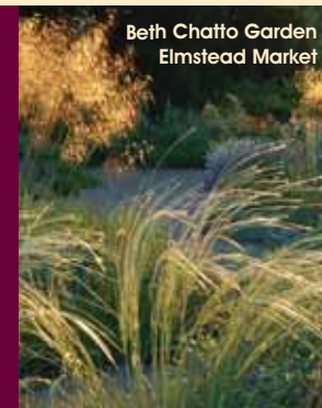
Beth Chatto Garden Elmstead Market

Walton Tourist Information Centre 01255 675542 (Seasonal Facility)