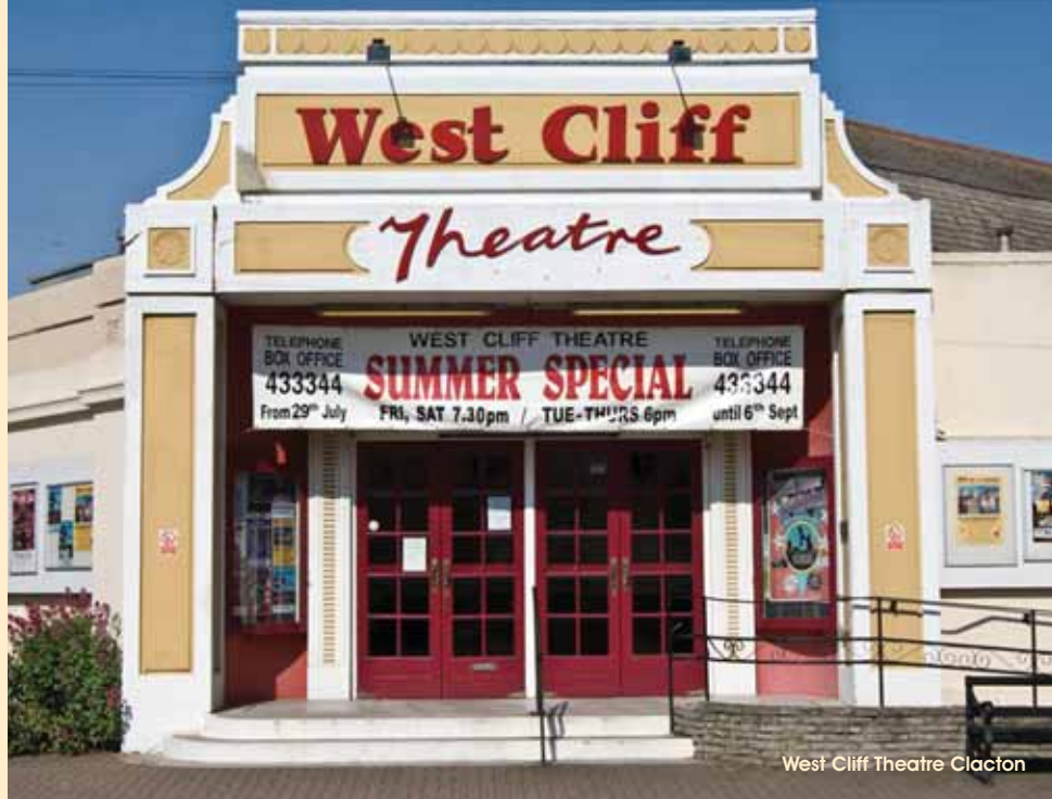
West Cliff Theatre Clacton

For a listing of local events log-on to www.essex-sunshine-coast.org.uk and click "What's On" or contact the Tourist Information Centre (details on the back of this guide.)