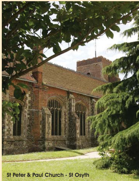
St Peter & Paul Church - St Osyth

Another legacy of the Essex Sunshine Coast are the Martello Towers. This line of defensive fortresses located along the coast in Walton-on-the-Naze, Clacton-on-Sea, Jaywick and Point Clear were initially built in the 1800's to resist a potential invasion by Napoleon.