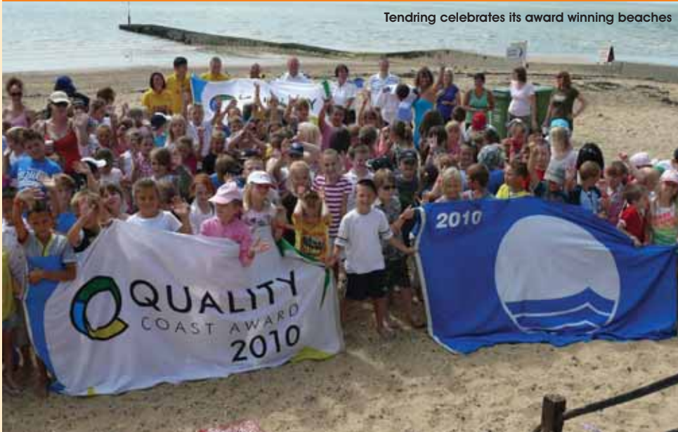
Tending celebrates its award winning beaches

With over 36 miles of beautiful sandy beaches, from bustling resorts to tranquil hidden gems find your perfect getaway... Not only are they good to look at, Tending beaches have received awards for achieving the highest quality in water, facilities, safety, environmental education and management.