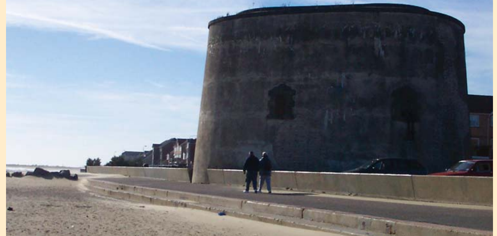
Clacton Martello Tower

Celebrate England's fantastic architecture and culture by offering free access to properties that are usually closed to the public or normally charge for admission. Every year on four days in September (8-11 September 2011) buildings of every age, style and function throw open their doors, ranging from castles to factories, town halls to tithe barns, parish churches to Buddhist temples. For more information or to find what open days are taking place in Tendring call 0844 335 1884 .