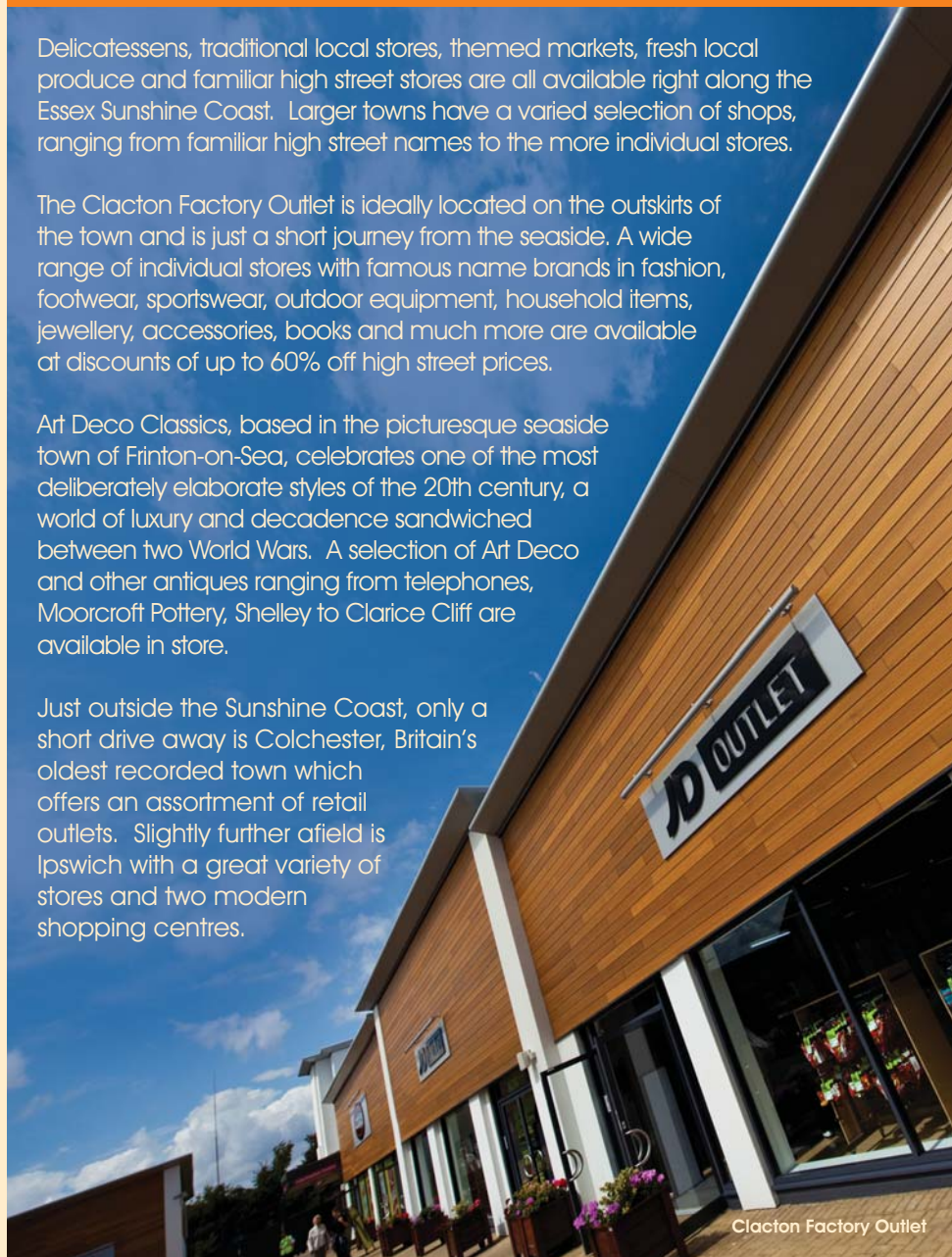
Clacton Factory Outlet

Just outside the Sunshine Coast, only a short drive away is Colchester, Britain's oldest recorded town which offers an assortment of retail outlets. Slightly further afield is Ipswich with a great variety of stores and two modern shopping centres.