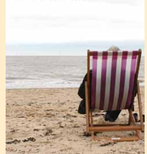
Deck chair on Clacton beach

Visit our web-site: www.essex-sunshine-coast.org.uk For both audio and large print information on the Essex Sunshine Coast – Tendring Coast & Countryside. Large print leaflets and braille leaflets are also available from Clacton Tourist Information Centre.