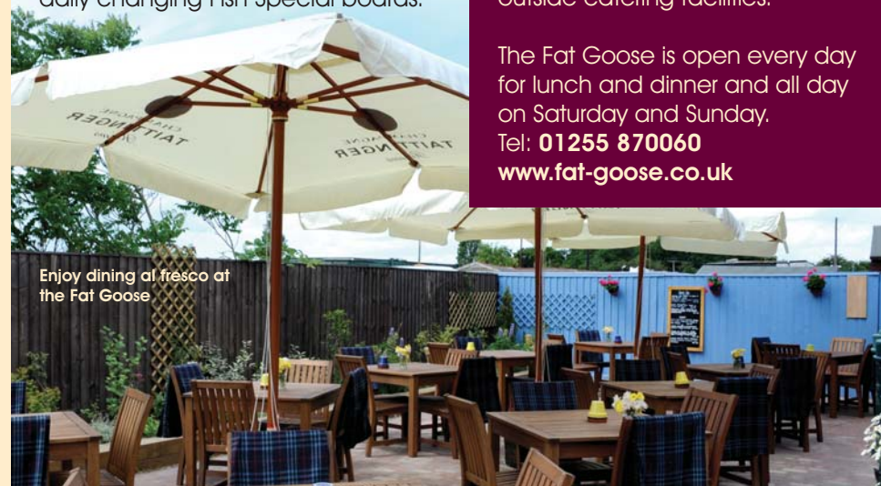
Enjoy dining al fresco at the Fat Goose

On cooler days two open fires provide a cosy ambiance and the ideal surroundings to enjoy a glass of wine by the fire, or just meet friends for a drink. The menu features local and seasonal produce and is complemented by daily changing Fish Special boards.