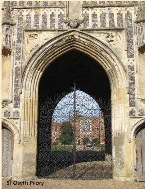
St Osyth Priory

For more information on Culture & Heritage on the Essex Sunshine Coast log on to: www.essex-sunshine-coast.org.uk