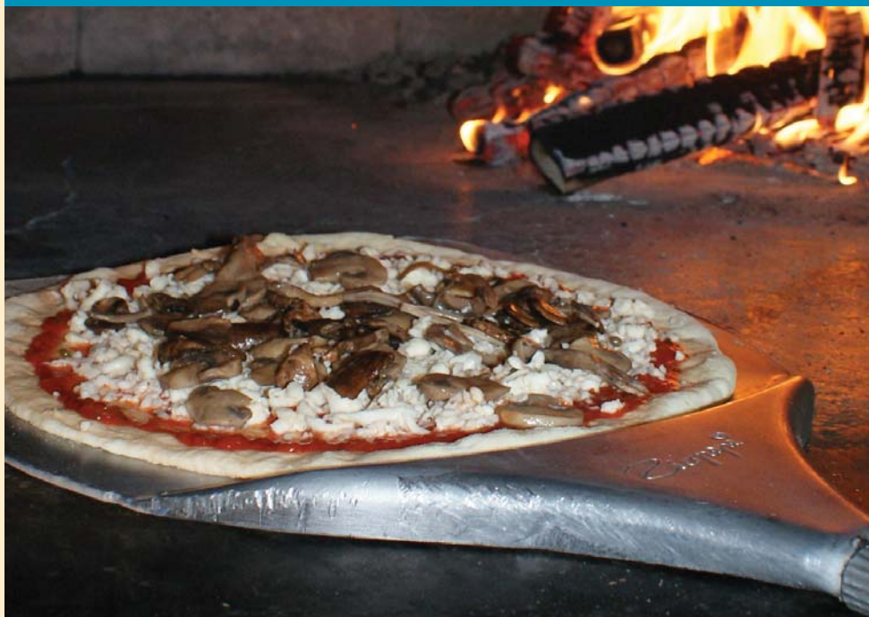
Lucca pizza restaurant in Manningtree

There is nothing like alfresco dining or eating out beside the seaside. The Boardwalk Bar & Grill is ideally located on Clacton Pier and boasts sea views overlooking an award winning beach.