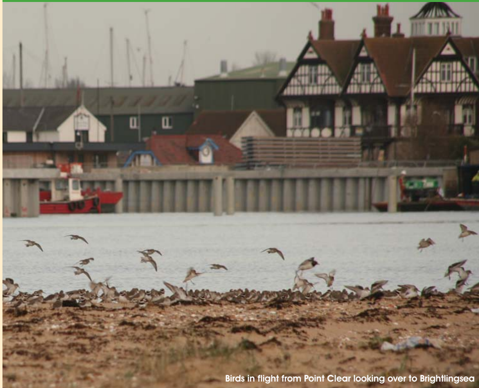
Birds in flight from Point Clear looking over to Brightlingsea

As well as an award winning coastline to discover, the local villages offer many delights to explore. Open gardens, village fetes and town shows, such as the Tendring Hundred Show taking place in July, are a colourful feature of what you can expect from your visit.