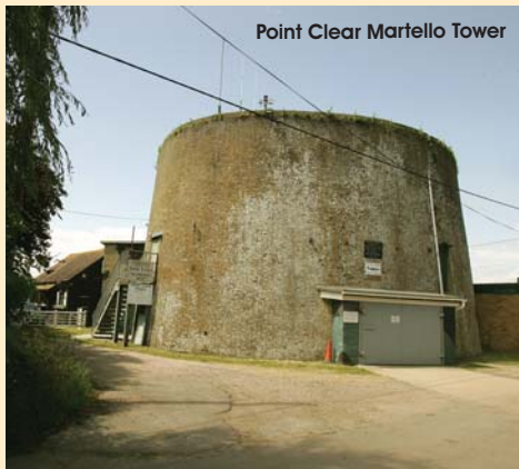
Point Clear Martello Tower

For more information on Culture & Heritage on the Essex Sunshine Coast log on to: www.essex-sunshine-coast.org.uk